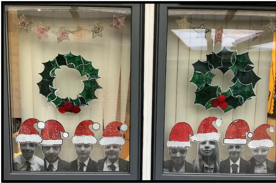
Year 5 Sycamore and Beech