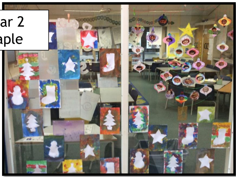
Year 2 Maple