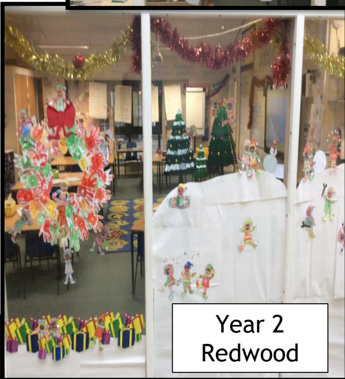
Year 2 Redwood