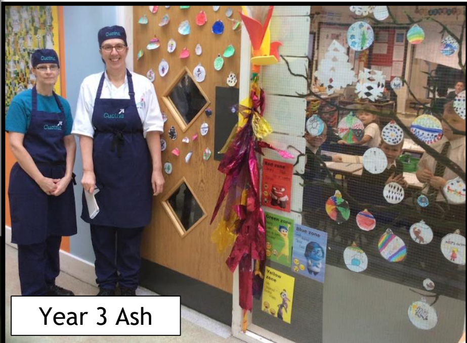
Year 3 Ash