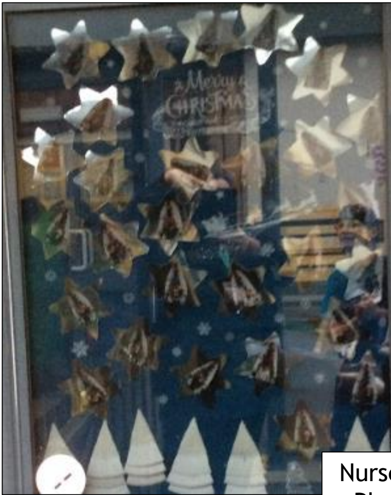
Nursery Plum Class