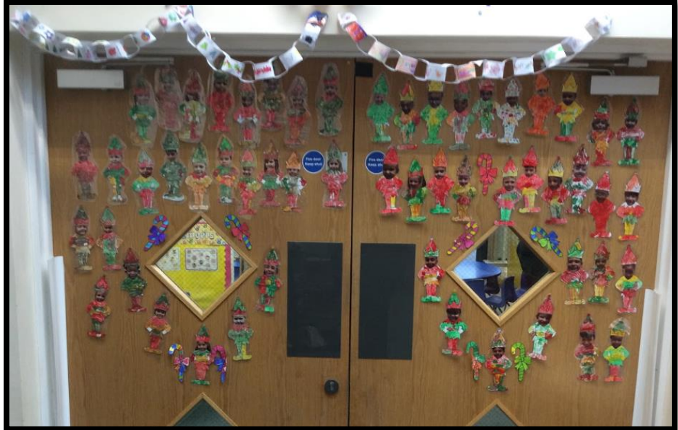
Reception Peach and Pear Class