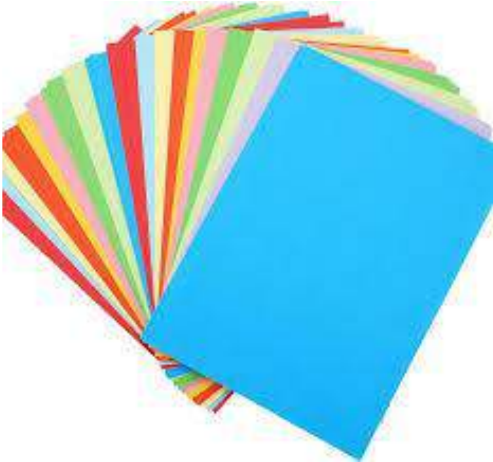
Paper and card