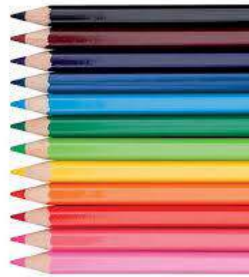
Pencils and crayons