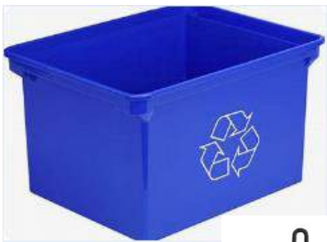
1. BLUE BIN